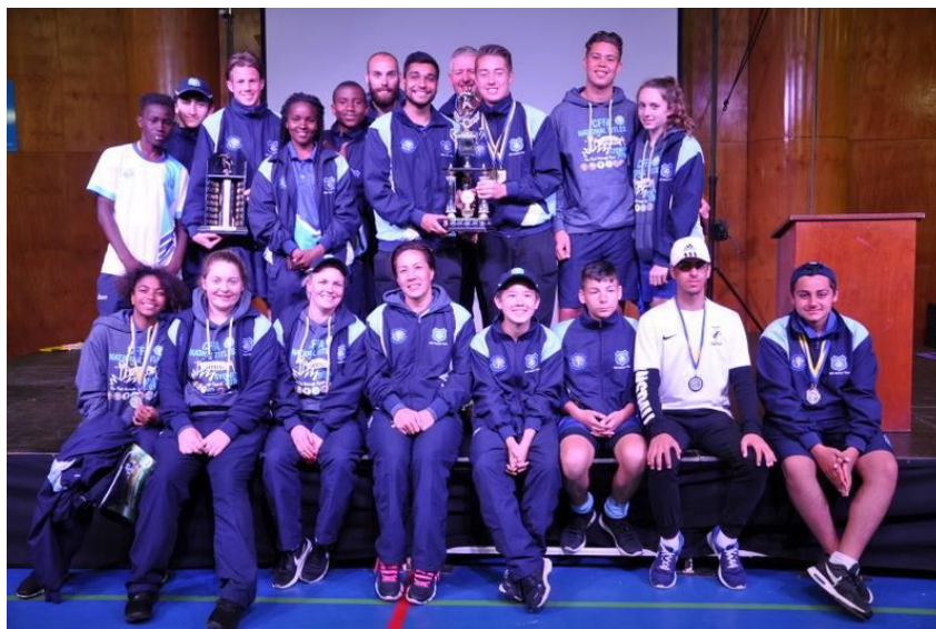
McCredie players and coaches at last year's National Titles.

Senior Ladies – 26 th and 28 th June, 7.30pm