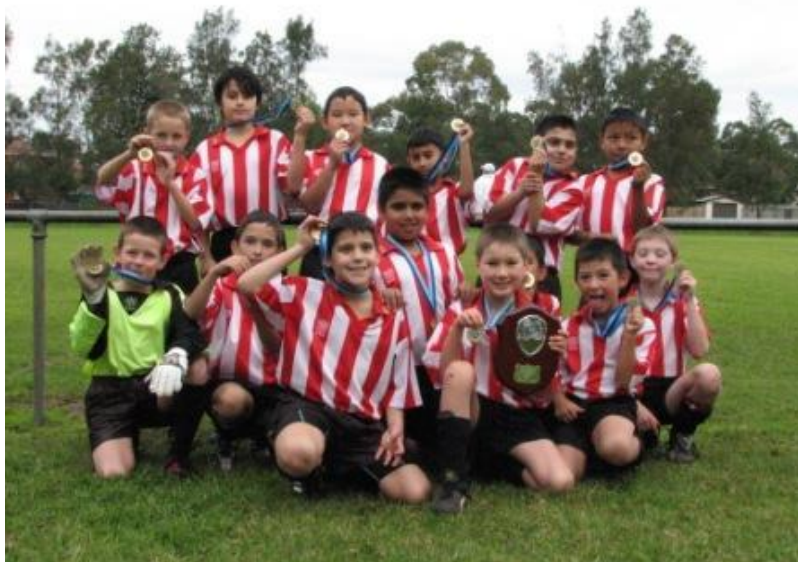
The boys show off the shield and their medallions